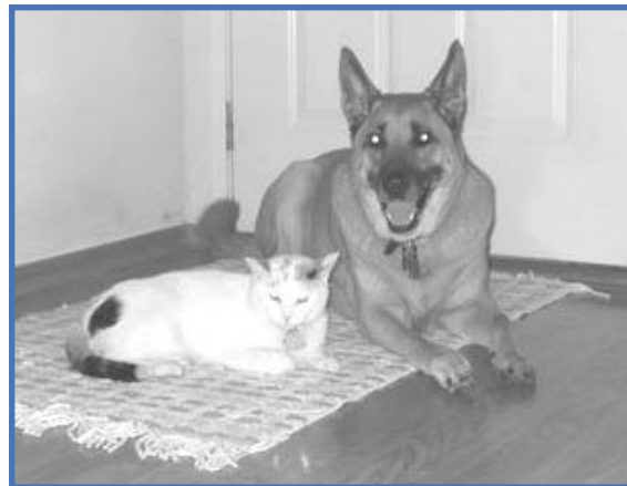
“Katie” (renamed “Sophie”) and Lenny

Kit Kat returns to her friend complete with a serious respiratory infection. At one point, Kit Kat was so sick her friend gave her fluids subcutaneously (under the skin) and tried to feed her with a syringe just to get something in her system. She wouldn't eat because she couldn't smell. There was a humidifier running all the time to keep her airways from drying out. Kit Kat's best friend was afraid she was going to die. She had dropped from 9 pounds to 6 pounds. Her friend felt so guilty because she brought her down off the mountain with the hope of giving her a better life. Instead she was deathly ill. Despite this near death experience, Kit Kat was always affectionate, cuddly and happy when her best friend came home. After two weeks of nursing and worrying, Kit Kat's best friend put a particularly smelly mixed fish entree down for her to try. Kit Kat approaches it, sniffs and takes a bite then another